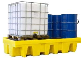
Spill Containment Pallets